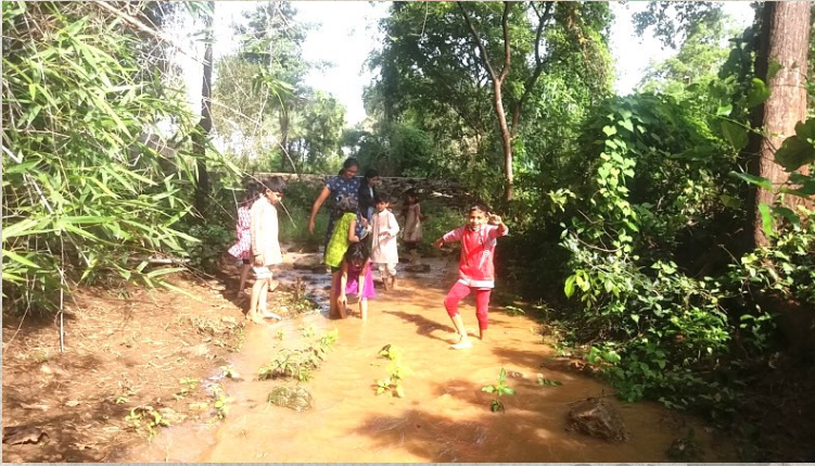
Children having fun @ the kaluve