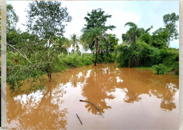
View of the kaluve after the rains