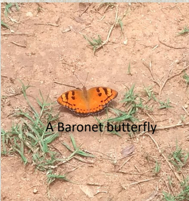
A Baronet butterfly

Some of them appear during the day while many others sneak in at night when there is no one.... Do you want to know who they are?