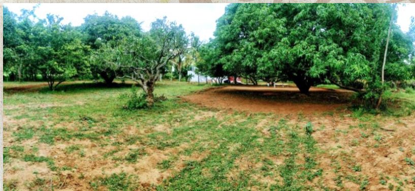
View of our campus before we moved in