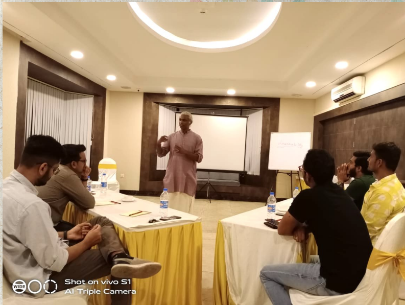
Leadership development program for managers