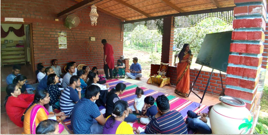
Udabhavaha Parichaya, a public program