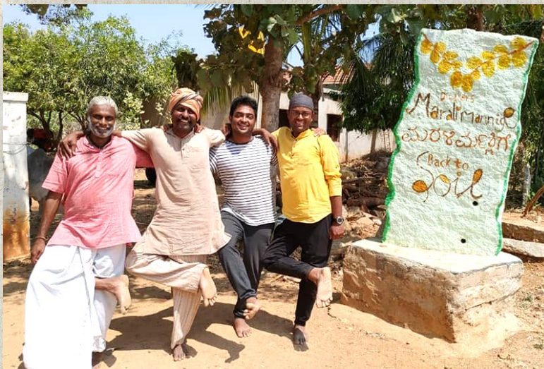
The teachers who walked the entire distance barefoot