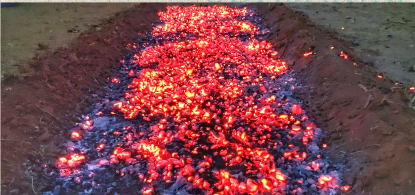
Can you walk on Fire?