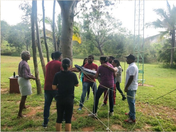
Team-building program at Camp Srishti