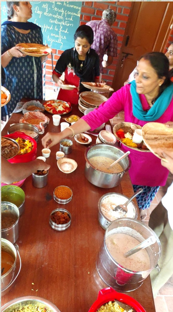
Yummy pot-luck by mothers!