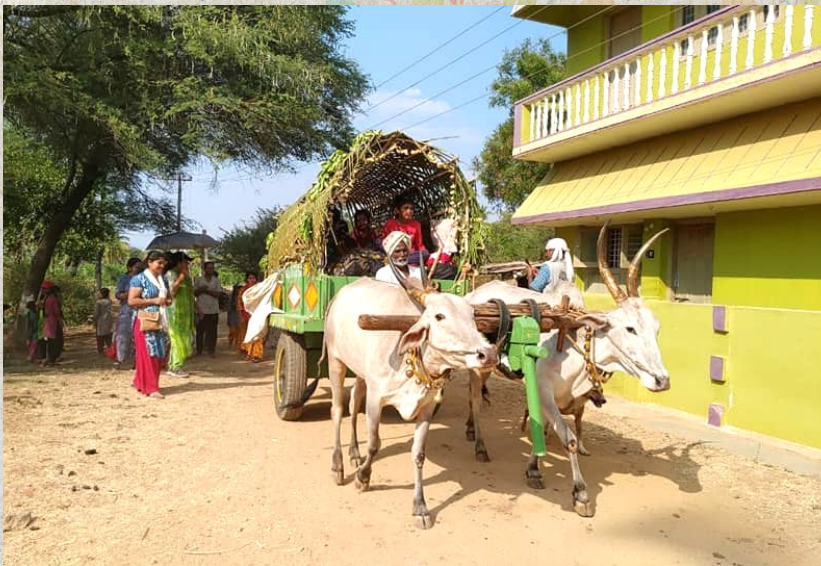
The bullock cart that carried our luggage and some tired feet