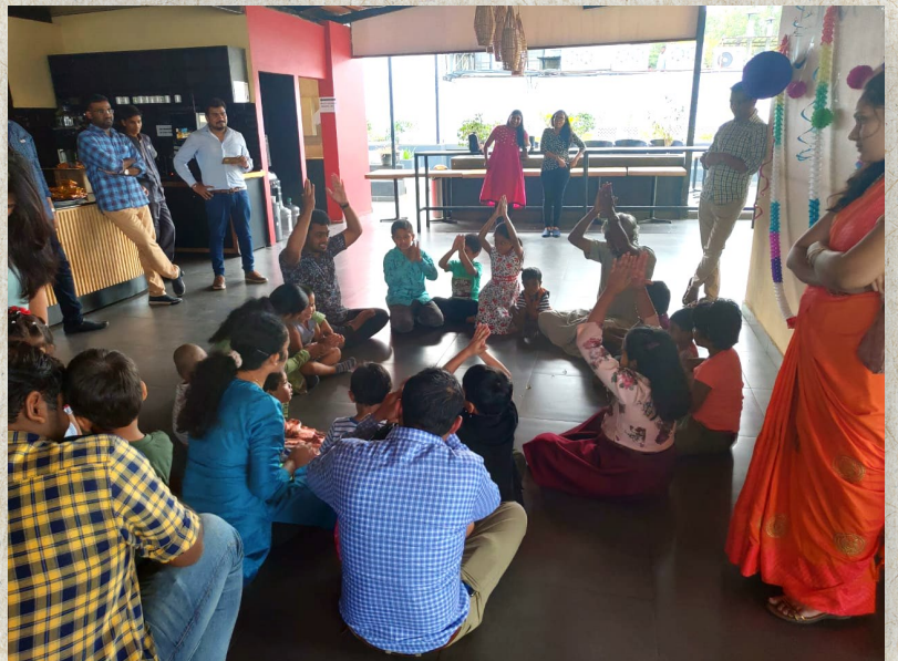
Childrens' Day program at Scalers office premises