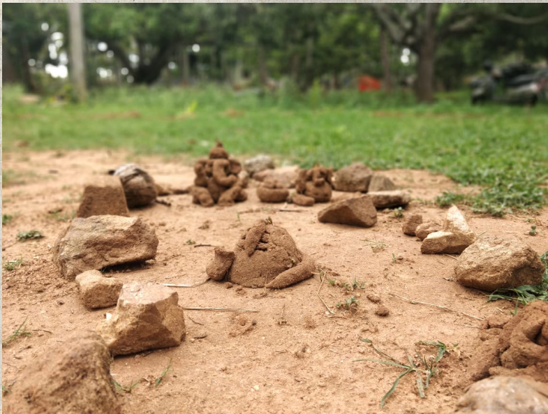
Ganesha idols made with mud