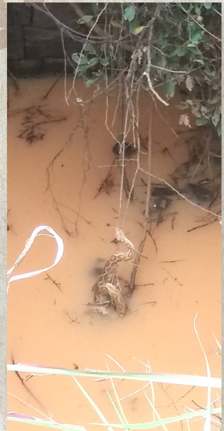
A Russell's Viper that had to be rescued