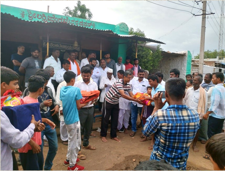
August 2019 – Distributing essentials to flood victims