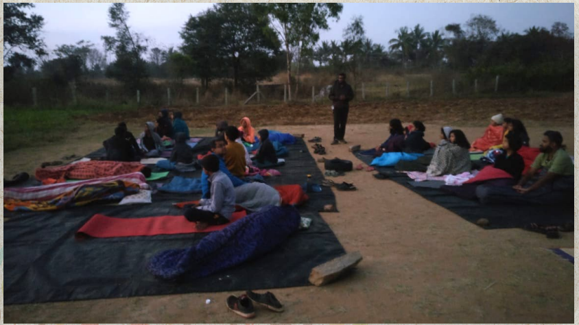
Star-gazing session led by Capt. Preetham