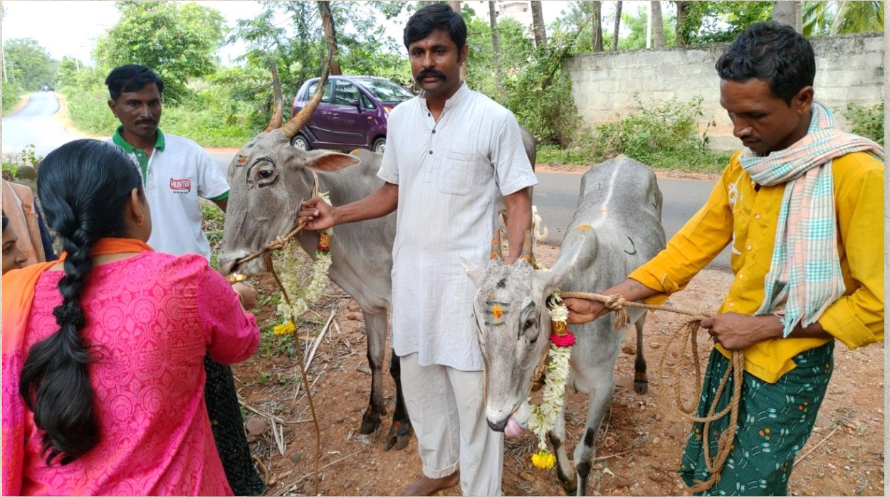
Yamuna and Sarayu arriving at Udhbhavaha