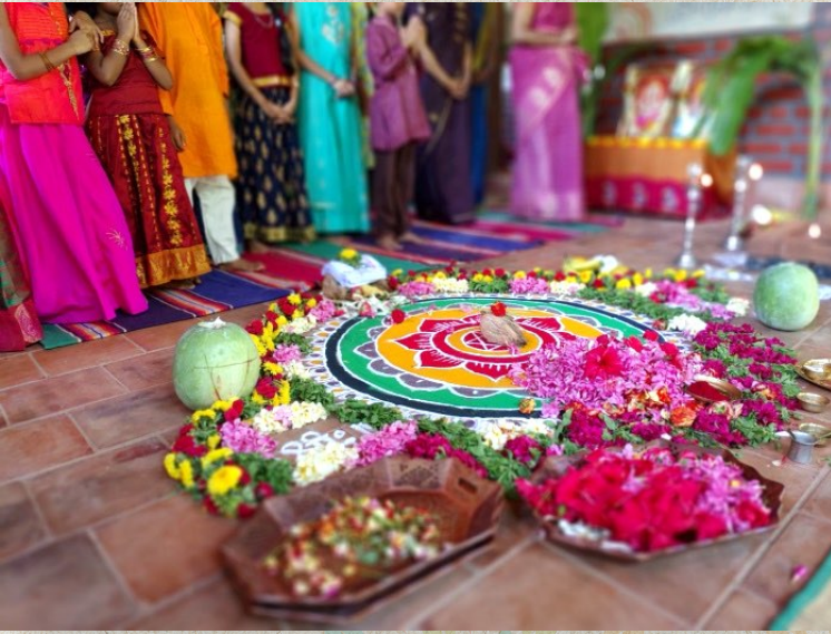
Arrangements and decorations for the homa

We initially planned a temporary arrangement to start classes in a few parents' homes, since we felt the new premises needed to be repaired and worked upon, to make it suitable for our use. However, as the start date came closer, that seemed unviable. So on 16 th of June, foreseeing practical difficulties, we decided to begin at Udhbhavaha campus, making best use of the infrastructure that was already in place. The whole community came together to get the campus ready and it is no less a wonder that it was made possible. 19-Jun-2019, true to its name, UDHBHAVAHA became a reality, emerging from our hearts and minds onto terra firma. We conducted Veda Vyasa Homa and Vidyaarambha ceremony with 20 children, 14 families and 11 teachers.”