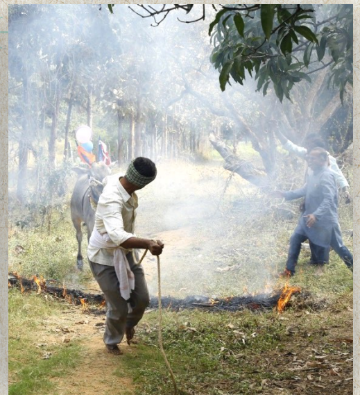
Cow jumping over fire