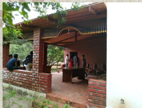
Teachers & parents inspecting the new campus