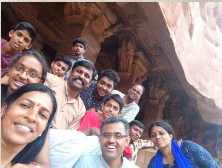
A visit to the temples of Badami