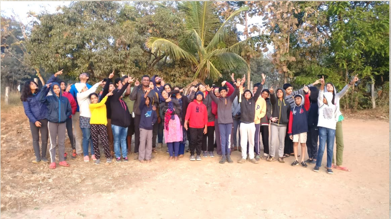
That's my favourite star / planet !!!