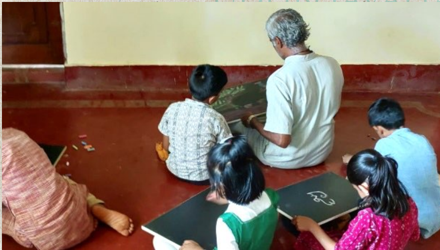
An academic class in progress