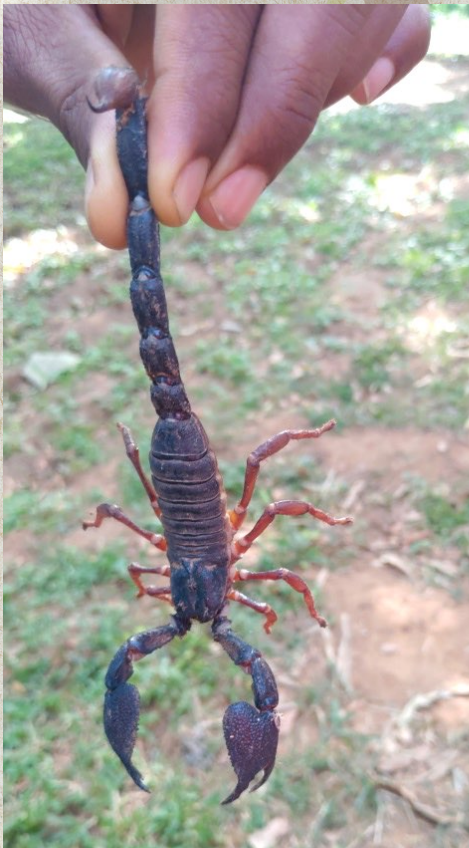
How to hold a scorpion