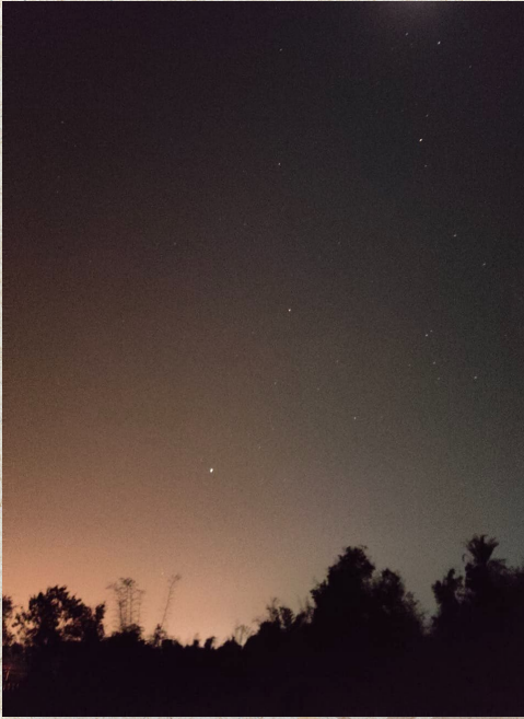
View of the night sky just before sunrise, showing Mars, Jupiter and Saturn