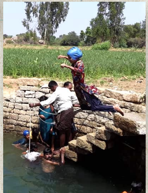
Oh, the joy of swimming in an open well!