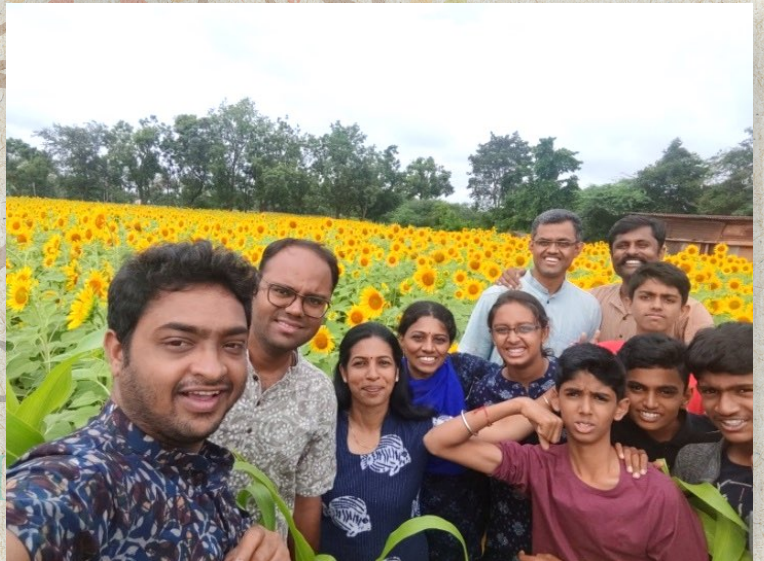
At a sunflower field while returning from Nargund