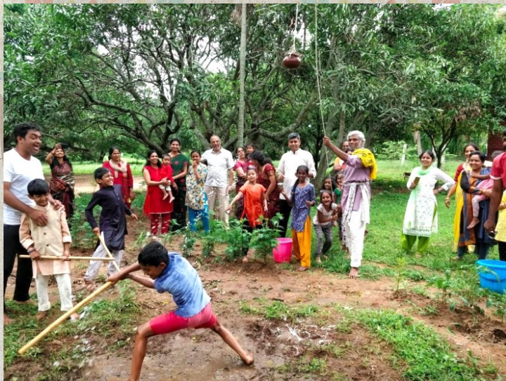
and the fun begins! Splash!