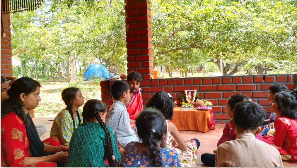
Guru Purnima puja