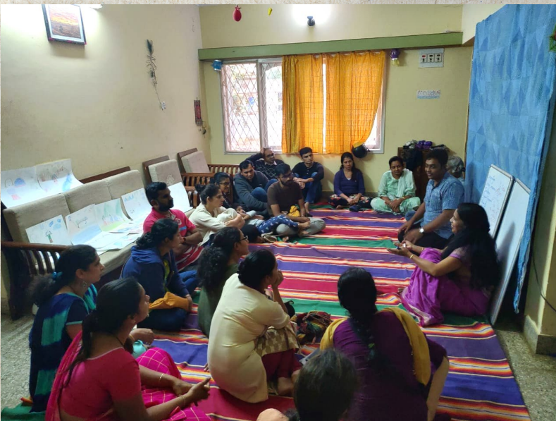
"Children" a puzzle to solve or a magical journey A workshop by our teachers