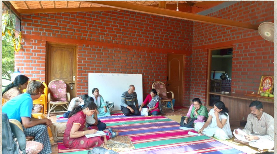
June 2019 – Manthan in progress