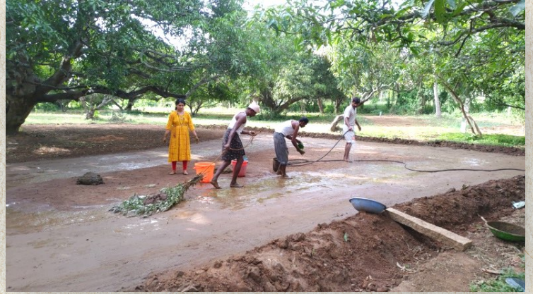
Getting the campus ready for day zero!