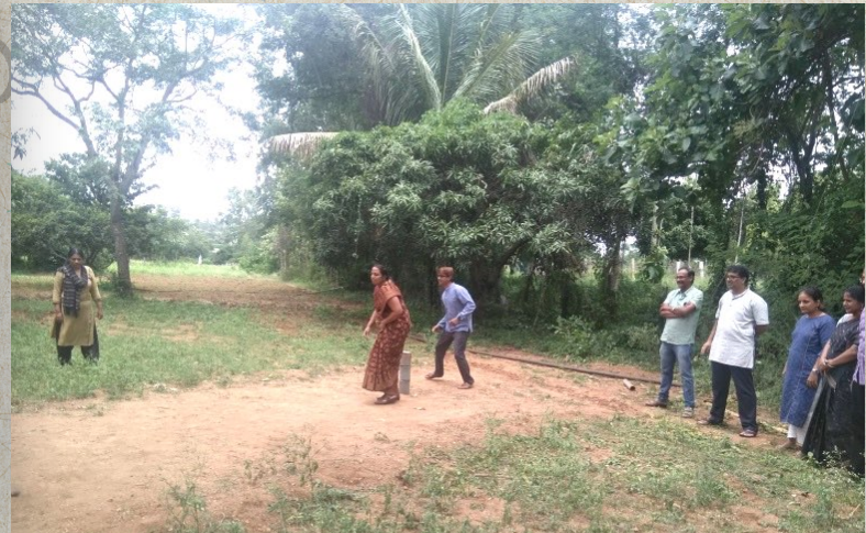
Let's play some leg cricket!