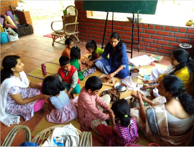
Preparing sweets for Janmashtami