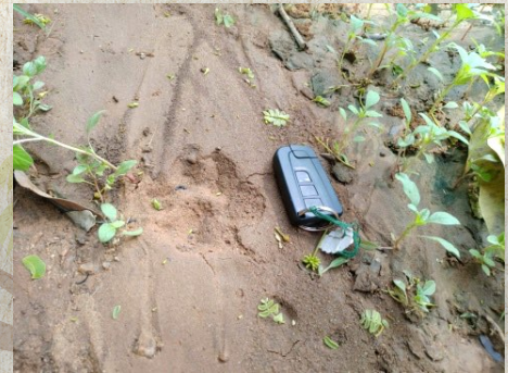
No, we weren't looking for the key. It's a leopard's pug mark!