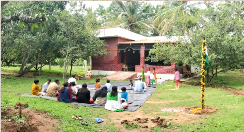
Independence Day celebrations